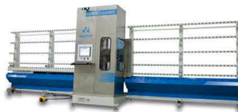
QUICKDRILL CLAMP MACHINE