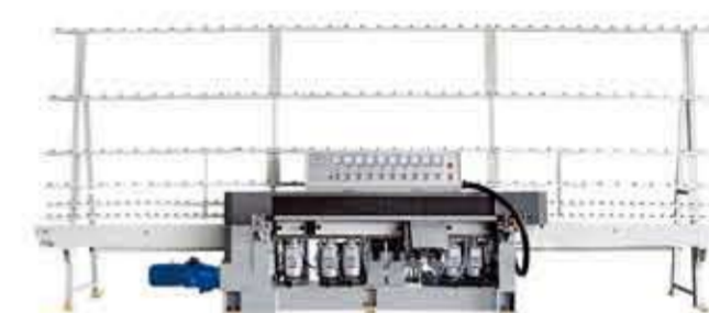
GRINDING SERIES EB925