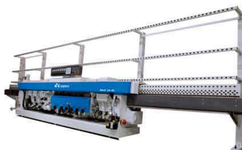
ROCK PROCESSING MACHINE